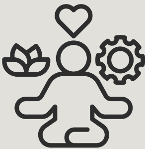
Anxiety & Stress Management