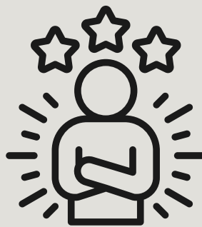
Confidence & Self Esteem